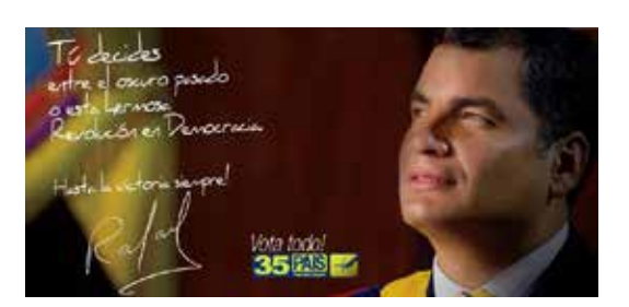
Rafael Correa stands up as the only leader for the citizen's revolution. Thus far, Alianza País, his political party, has appointed no successor.

However, the great milestone in fighting corruption has taken place in the last 18 month with the called "metida de mano en la justicia" handling the justice<sup>n</sup>. In May 2010, Ecuadorians approved by Referendum the creation of a Transitional Judiciary Council (whose members were appointed by three powers of the State) to reform the whole system of justice